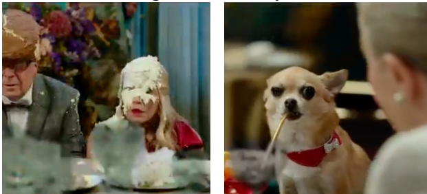
At Anthony's restaurant