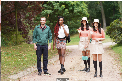
The children became young adults