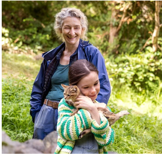
Clémence keeps the kitten. She takes it to the countryside. They meet Madeleine, the neighbour.