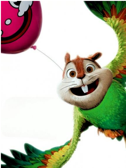
The squirrel who wanted to be a flying bird